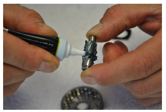
Step 16: Apply PENN reel grease to the <u>new pinion gear</u> included in the Versa-Gear set.