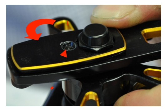
Step 37: Place locking plate over nut and tighten clockwise until the holes lines up for the screw