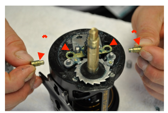
Step 13: Remove yoke pins