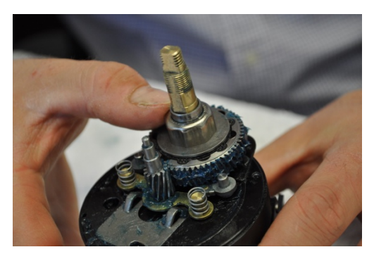
Step 28: Place instant anti-reverse bearing back on mainshaft