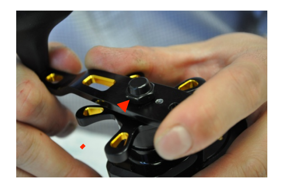
Step 36: Place nut on mainshaft and hand tighten