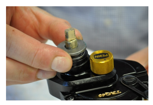
Step 31: Place the two tension washers on mainshaft