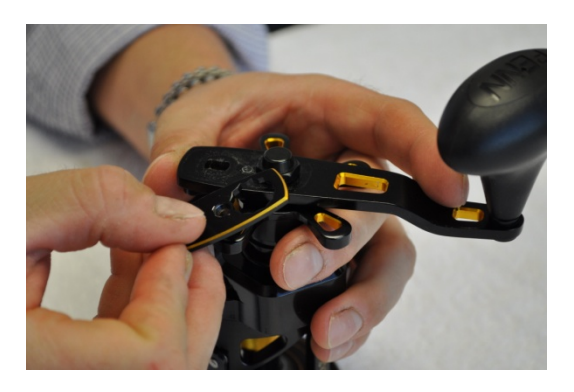
Step 2: Remove handle screw lock plate