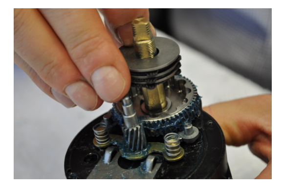
Step 26: Install drag stack on main shaft and place in side the main gear. The slots on the keyed washers will fit inside groves on the main gear.

The order of the drag stack from bottom to top is: HT-100, Steel Washer, HT-100, Steel Washer, HT-100, and on top of the stack a final Steel Washer