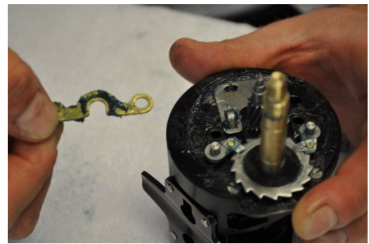
Step 14: Remove yoke