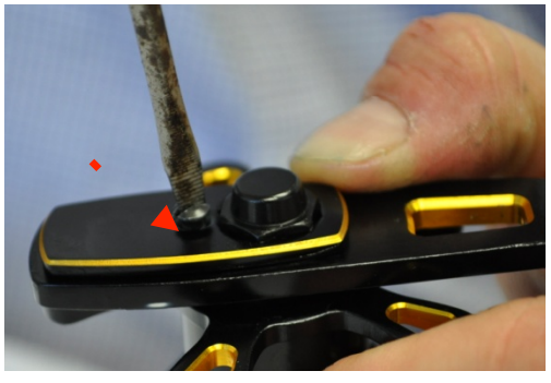
Step 38: Place screw in hole and tighten using a small flat head screw driver