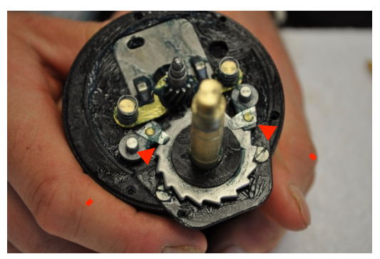
Step 22: Make sure anti-reverse dogs are engaged before finishing assembly or the side plate will not fit onto reel correctly.