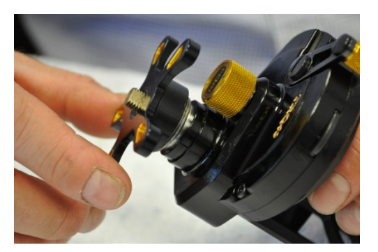
Step 33: Screw the star on by turning clockwise. It will start clicking as it gets tight.

How to install Versa-Gear™sets in PENN Torque™ Star Drag reels