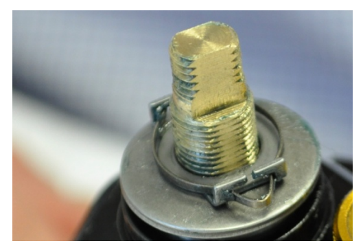
Step 32: Place dent assembly on mainshaft above tension washers