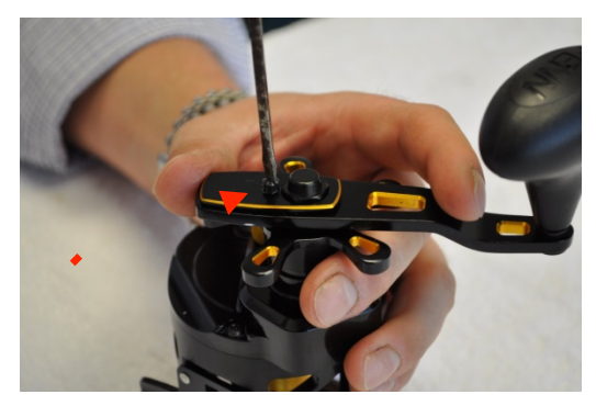
Step 1: Remove handle screw using a small flat head screw driver

Supplies needed: Small flat head screw driver Versa-Gear set PENN Reel Grease (included in Versa-Gear set) Torx Wrench (included with reel) Mat or White Towel to set supplies on