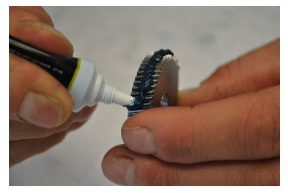
Step 23: Use PENN reel grease tube to apply grease all the way around <u>new main gear</u> included in the Versa-Gear set