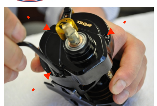
Step 7: Use torx wrench to loosen three screws on side plate

How to install Versa-Gear™sets in PENN Torque™ Star Drag reels