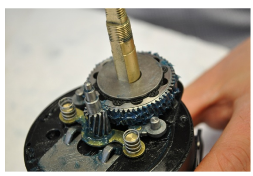
Step 27: Final assemble will look like this

How to install Versa-Gear™sets in PENN Torque™ Star Drag reels (Page 5)