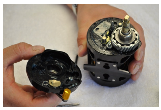
Step 8: Remove side plate