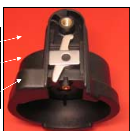
Figure D: New rotor with upgraded parts