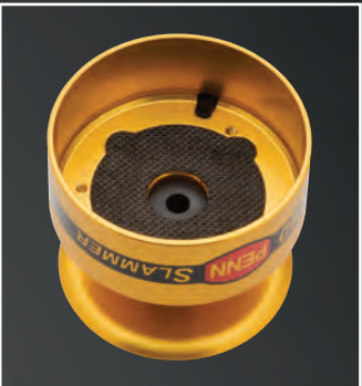
The Slammer's oversize HT-100™ powered drag system is designed to deliver enormous power with smooth transitions.