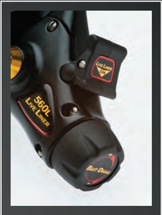
The Slammer's automatic engaging live-liner system takes the challenge out of live baiting.