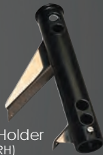
Rod Holder (#610RH) mounts easily and securely.