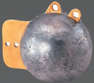
Downrigger Weight (#10W) 10lb weight drops line to the desired depth.

Penn offers a variety of accessories to use with the Fathom-Master™ downriggers. These accessories will maximize the performance of your Penn downrigger. For additional accessories not shown here, visit our website at www.pennreels.com and click on the Accessories page.