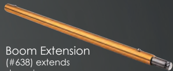
Boom Extension (#638) extends downrigger an extra 24"