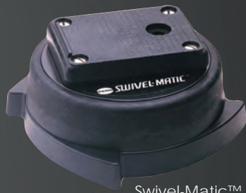
Swivel-Matic™ (#622ASM) attaches to the base of downrigger for easy positioning.