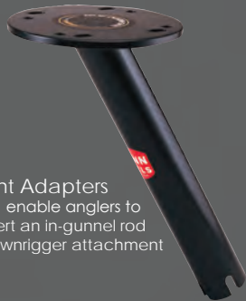
Quick-Mount Adapters (#632 # #634 ) enable anglers to instantly convert an in-gunnel rod holder to a downrigger attachment point.